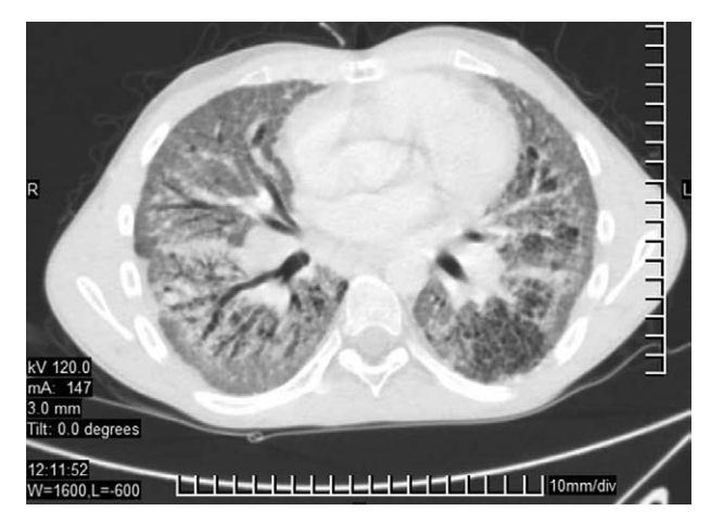
FIGURE 4. HRCT of the chest. Extensive ground glass opacification superimposed on the previously described reticular pattern compatible with the clinical development of acute lung injury (ALI)/acute respiratory distress syndrome (ARDS) upon usual interstitial pneumonia (UIP).