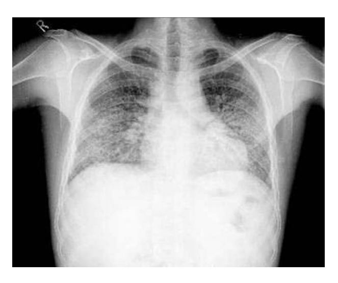
FIGURE 1. Chest X-ray depicting a hazy opacification especially in both middle and lower lung fields upon an extensive reticulation.

titative cultures grew positive for Klebsiella Pneumoniae species successfully treated with antimicrobials. During his hospital stay, gastroenteroscopy, capsule endoscopy and histologic examination of small-intestinal biopsy samples revealed alterations suggestive of CD without further complications.